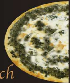
Spinach & Cheese